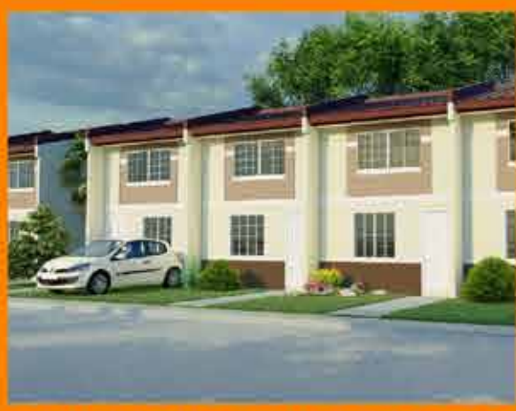
TOWNHOUSE 44 W/ CARPORT FLOOR AREA: 44 SQ.M.