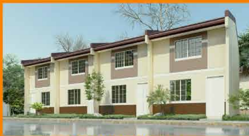
TOWNHOUSE 44 FLOOR AREA: 44 SQ.M.