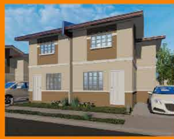
DUPLEX 50 FLOOR AREA: 50 SQ.M.